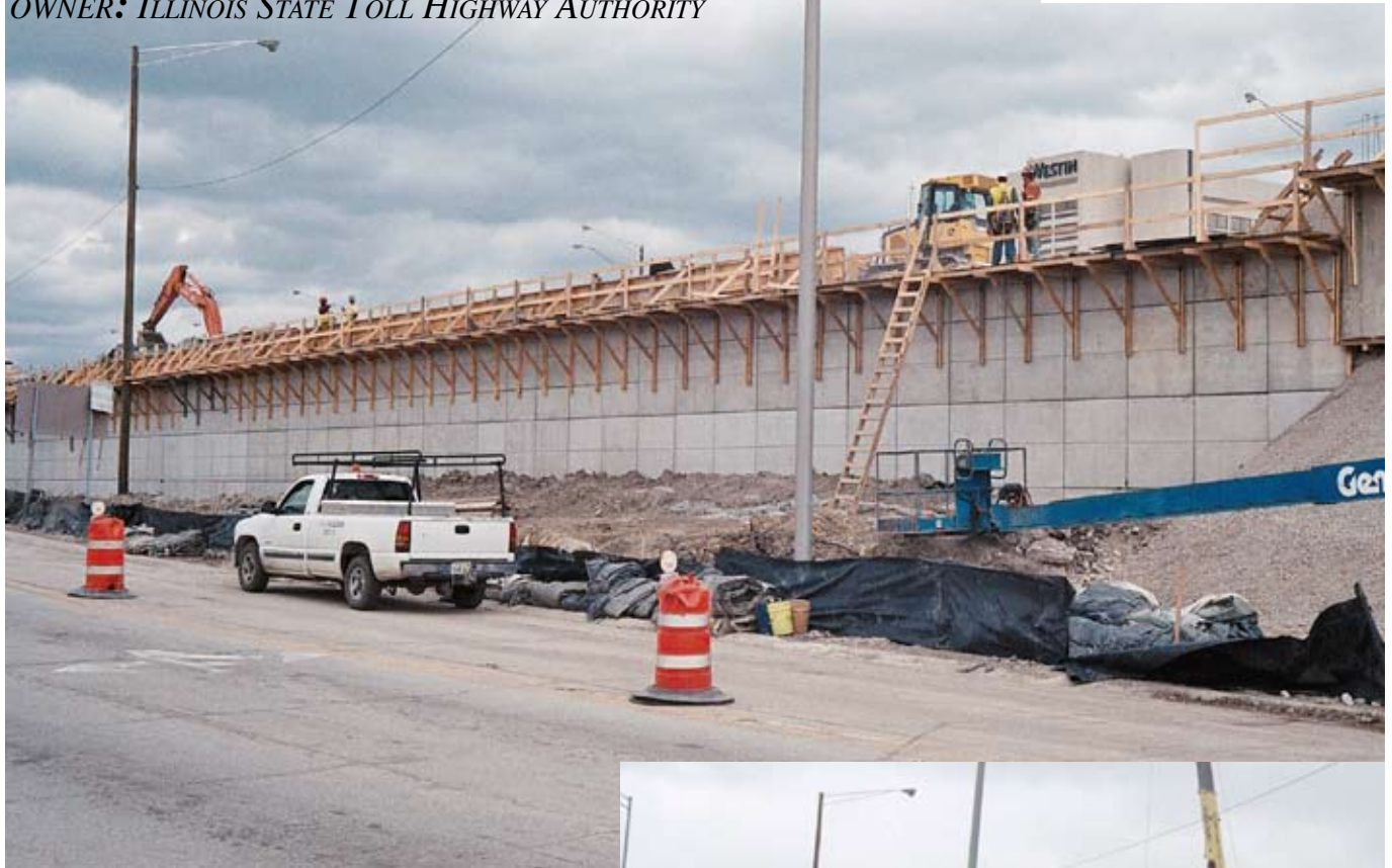
BELOW: CAST-IN-PLACE BARRIER IS BEING POURED ON TOP OF THE T-WALL® UNITS.