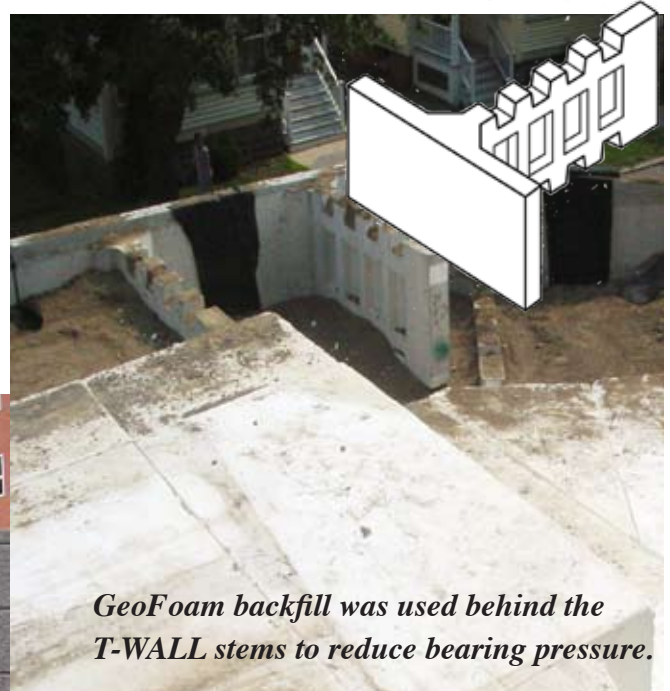
GeoFoam backfill was used behind the T-WALL stems to reduce bearing pressure.

DESCRIPTION: T-WALL was used to build a level ambulance parking facility in the Center's narrow sloped right-of-way.