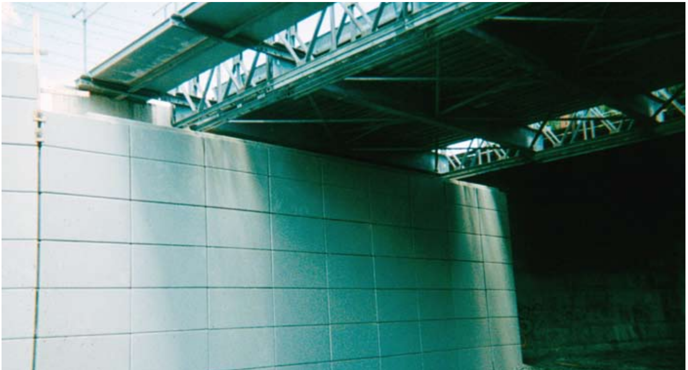
BRIDGE WIDTH: 30 FEET