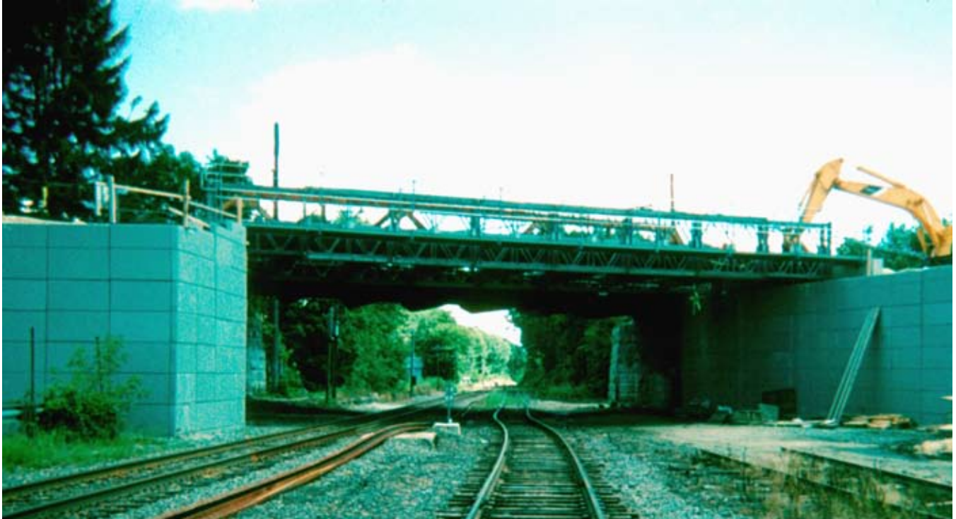
BRIDGE SPAN: 80 FEET