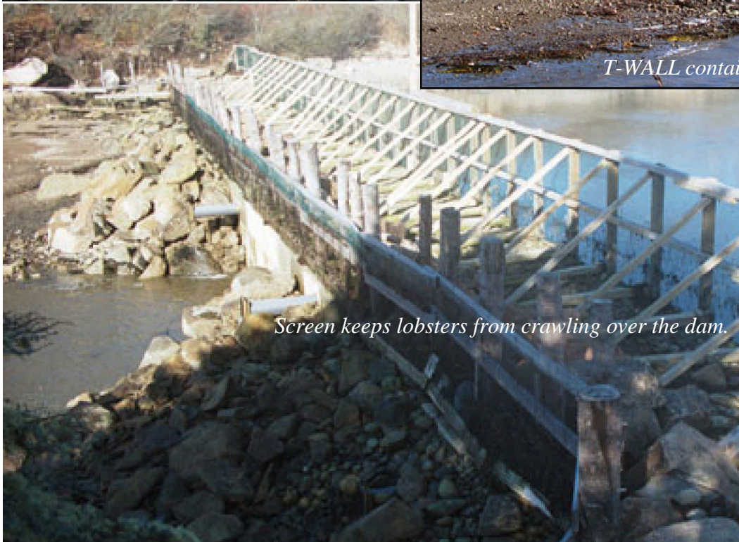
Screen keeps lobsters from crawling over the dam.

You can see the difference in the water levels. The box culverts allow for periodic flushing of the pond.