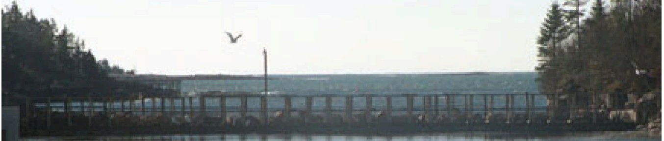
T-WALL dam between the ocean and the lobster pond.