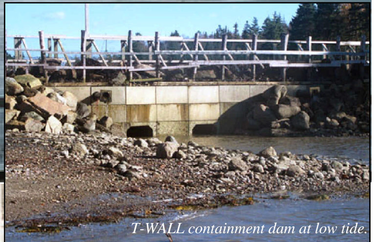
T-WALL containment dam at low tide.